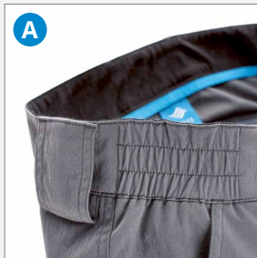
A Elastic waistband for optimal comfort

The ergonomic shape of the trousers is designed for the reclined flying position of the glider pilot. The legs are a bit longer than for a normal trouser, ensuring that the ankles are covered and thereby protected from the cold or sunrays. The knee areas are anatomically shaped, guaranteeing optimal fit of the trousers.