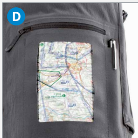
D Pouch for notes, checklists and maps