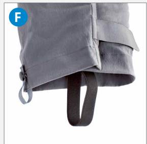
F Extra long trouser legs with wind proofing details