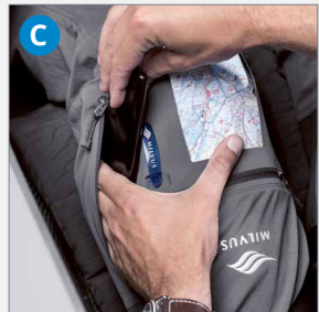
C Quick and easy access to your equipment